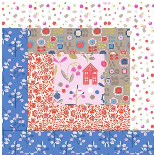
Block 2 (sew 8 in total)

Now lay out all your blocks, sashing and small squares as in the main diagram