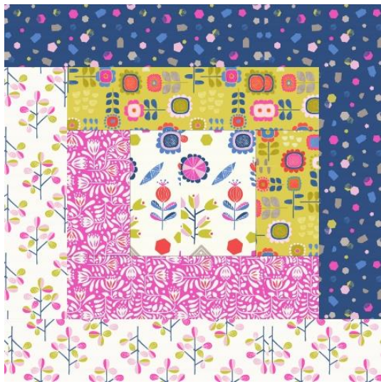
Block 1 (sew 8 in total)

Again, sides and then the last strips top and bottom