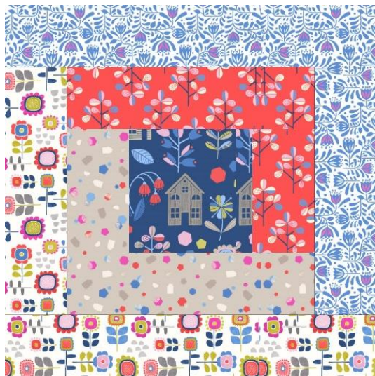
Block 1 (sew 8 in total)

Again, sides and then the last strips top and bottom