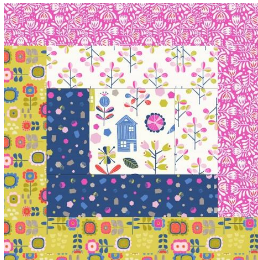
Block 2 (sew 8 in total)

Now lay out all your blocks, sashing and small squares as in the main diagram