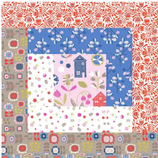
Block 1 (sew 8 in total)

Again, sides and then the last strips top and bottom