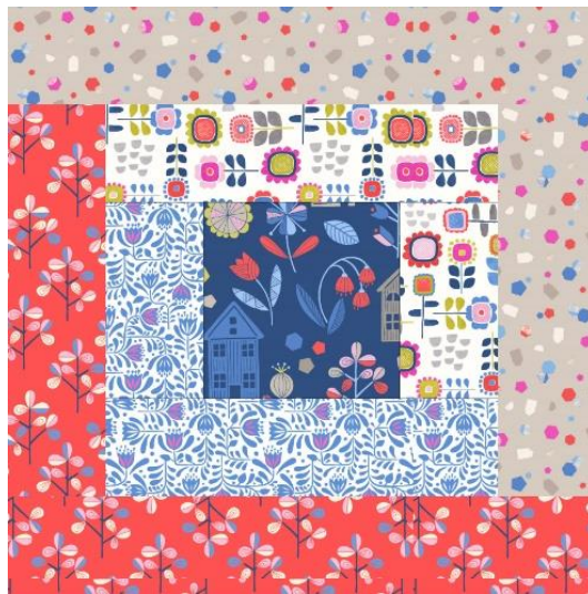
Block 2 (sew 8 in total)

Now lay out all your blocks, sashing and small squares as in the main diagram